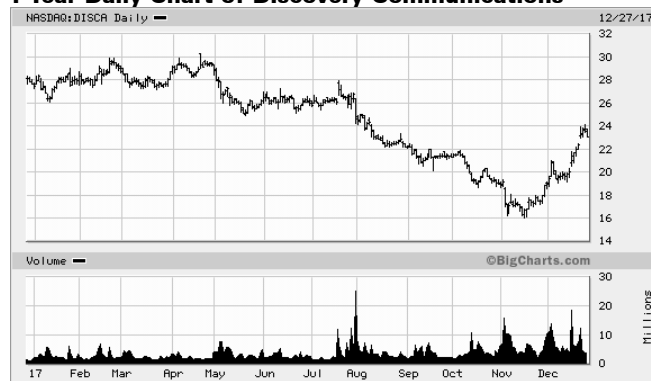
1-Year Daily Chart of Discovery Communications